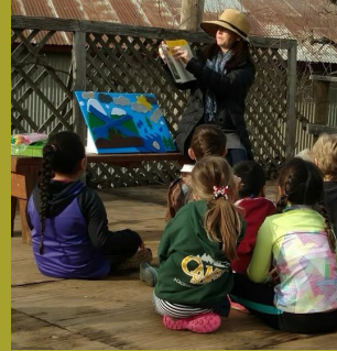
The Water Cycle is interesting!

ADDRESS EL DORADO COUNTY AG IN THE CLASSROOM P.O. BOX 522 SHINGLE SPRINGS, CA 95682