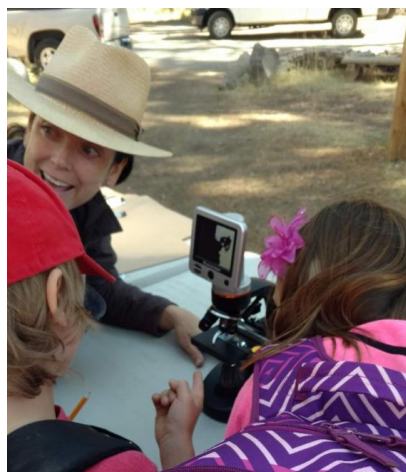
What is in the water? 3rd graders know!

We are always looking for sponsors in the South Lake Tahoe area to help us maintain and improve this wonderful program serving our Tahoe Basin 3rd graders.