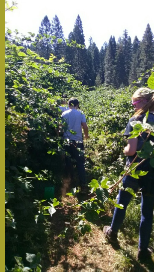
Picking blackberries from the canes middle school students tied up last Spring.

Looking forward to working with you as we Grow the Seed together, cultivating a love of, and respect for, agriculture in the lives of El Dorado County students!