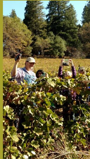
Grape juice in a bag!