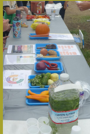
That is one Tasty Table!